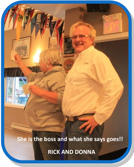
She is the boss and what she says goes!!