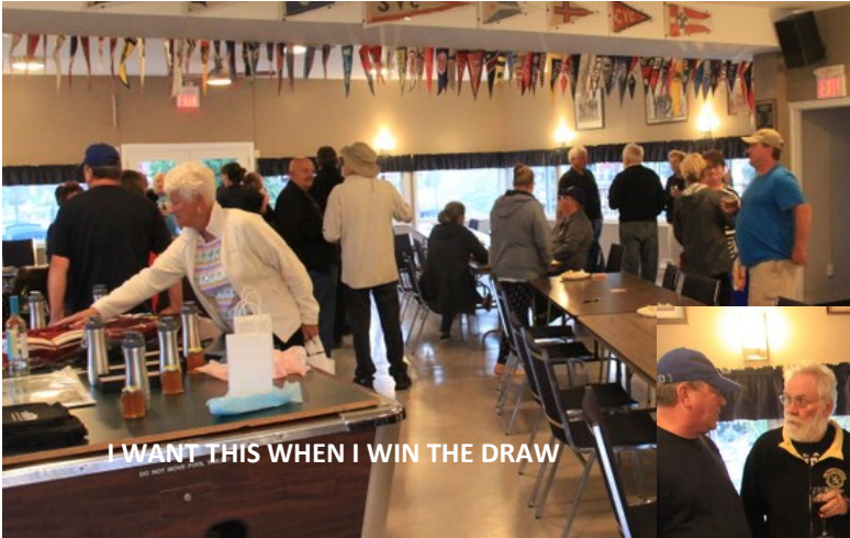
I WANT THIS WHEN I WIN THE DRAW