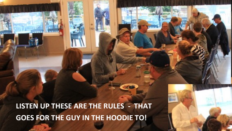
LISTEN UP THESE ARE THE RULES - THAT GOES FOR THE GUY IN THE HOODIE TO!