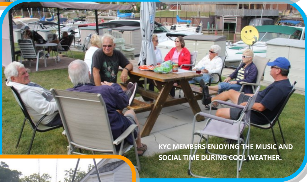
KYC MEMBERS ENJOYING THE MUSIC AND SOCIAL TIME DURING COOL WEATHER.