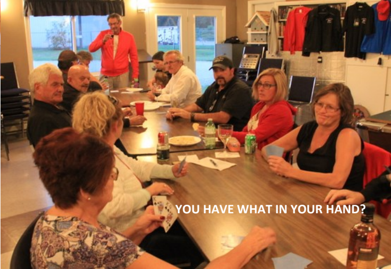
YOU HAVE WHAT IN YOUR HAND?