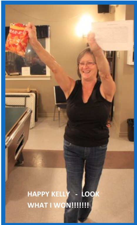
HAPPY KELLY - LOOK WHAT I WON!!!!!!