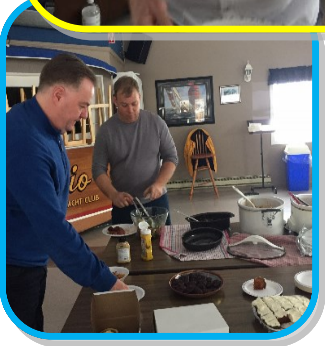
LOTS OF FOOD!