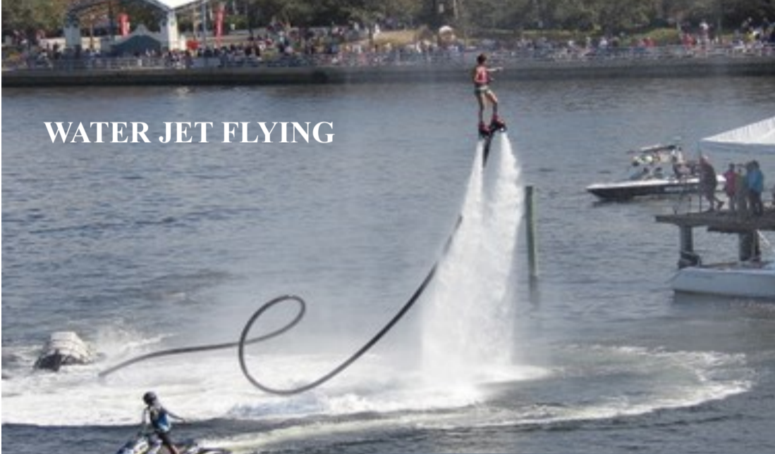
WATER JET FLYING