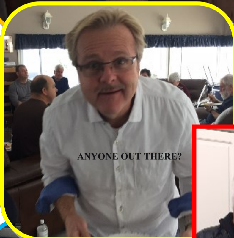
ANYONE OUT THERE?