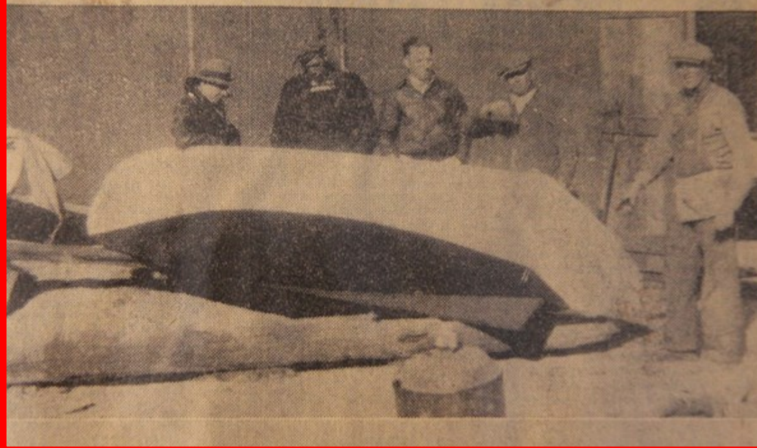
Yachtsmen Preparing For Season At Port Stanley

These photographs from the London Free Press in 1938, show YACHTSMEN from the KYC preparing for another Boating Season.