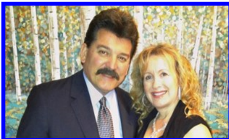
COMMODORE'S BALL 2016