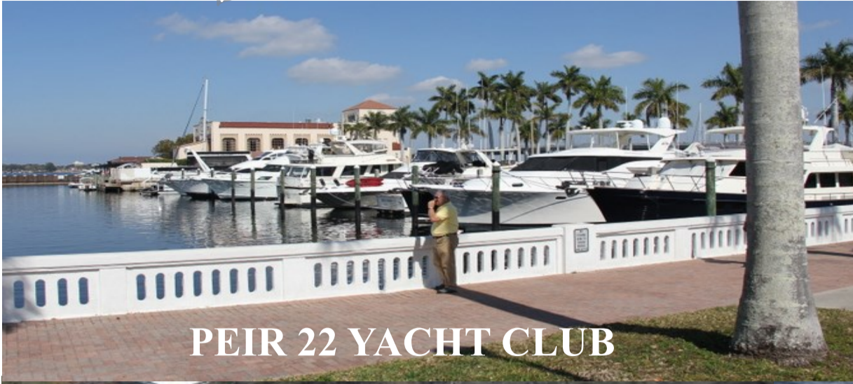
PEIR 22 YACHT CLUB