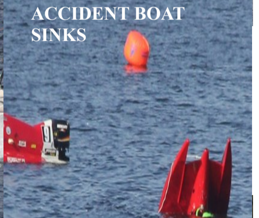
ACCIDENT BOAT SINKS