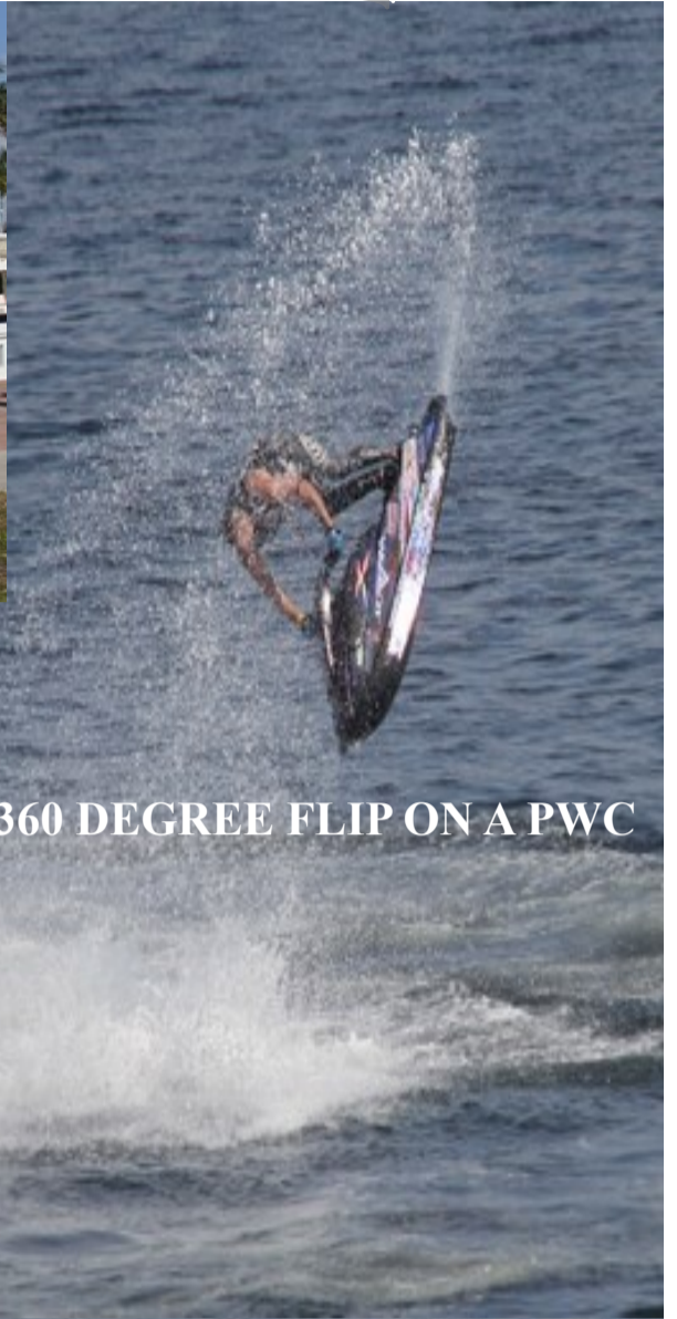
360 DEGREE FLIP ON A PWC